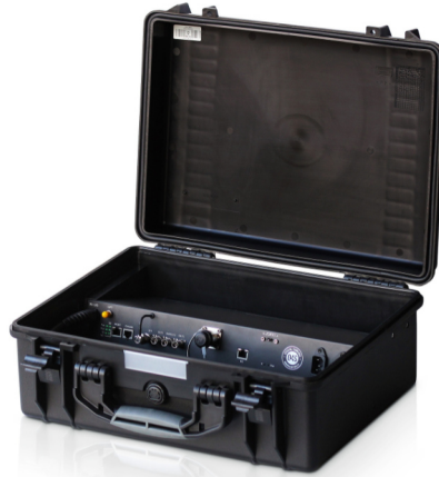
Q4S® Transceiver Field Box Fiber Optic Transceiver Video/LAN with optional 12G