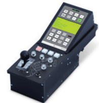
Q4S® RCP002 / 003 Universal Remote Control Panel