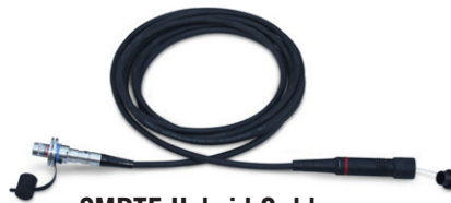
SMPTE Hybrid Cable Power and Fiber Lemo 3K connectors Up to 2Km