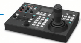
Sony RM-IP500 Remote Camera Controller