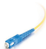
Extra Fiber Channel Additional Equipment Connection