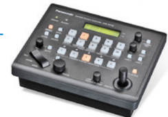
Panasonic AW-RP50 Remote Camera Controller