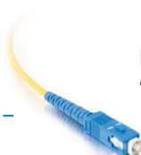
Extra Fiber Channel Additional Equipment Connection