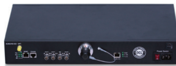
Q4S® Transceiver CCU Fiber Optic Transceiver Video/LAN with optional 12G